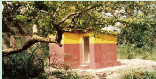
Ventilated Sanitary Facilities