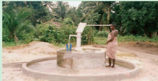
Drinking Water Wells