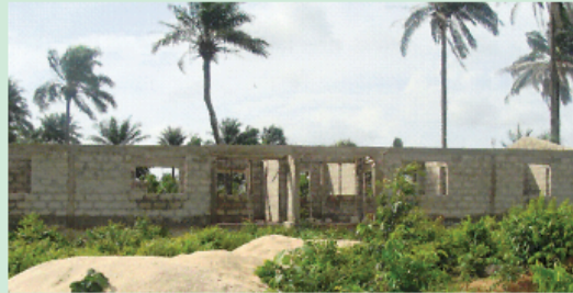
Classroom Block Under Construction